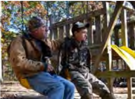
Remember the young man who made the stake outs for our walking trial gifts? Here he is being consoled on the loss of his dog Scoots.