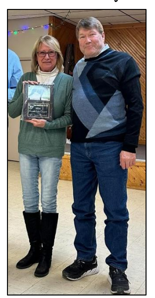
Princess Lilie Chagrin AKC Junior Hunter