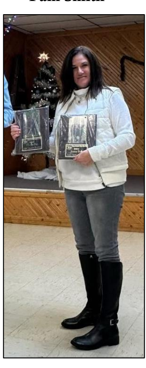
Journey River AKC Junior Hunter PJ's June Bug AKC Junior Hunter