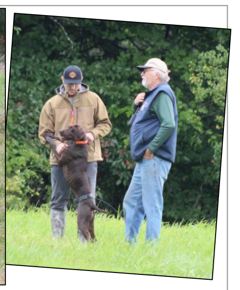
Tips and field work