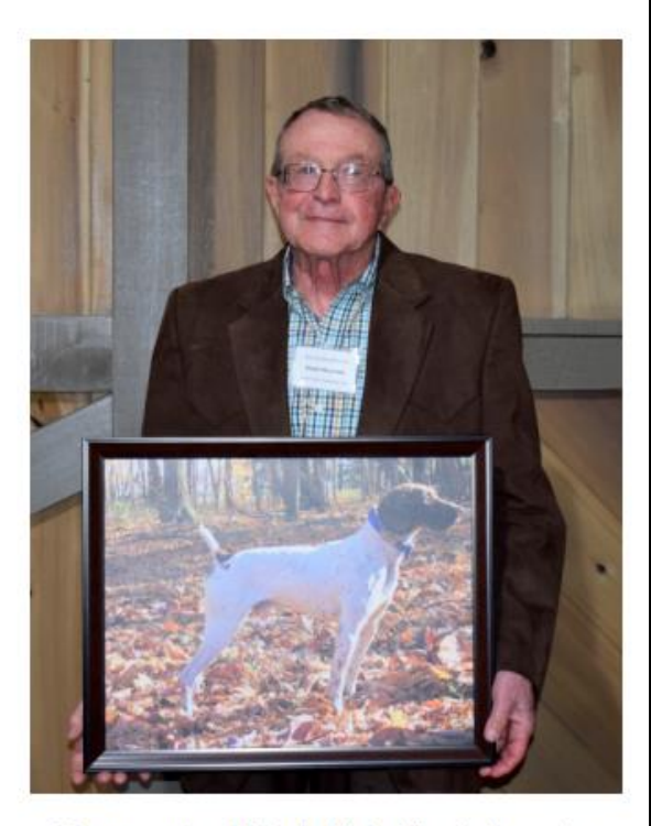
Photograph of Kyle's Hightailing Luke to be displayed at the Hall of Fame