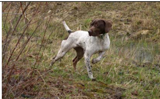
CALLI AFC & SENIOR HUNTER