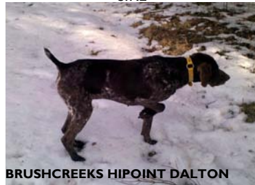
BRUSHCREEKS HIPOINT DALTON