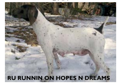
RU RUNNIN ON HOPES N DREAMS