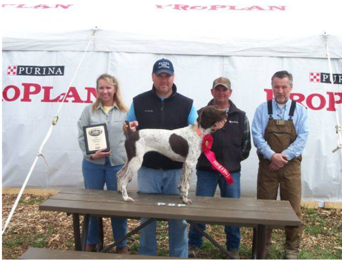
GPDA NATIONALS "DAISEY"