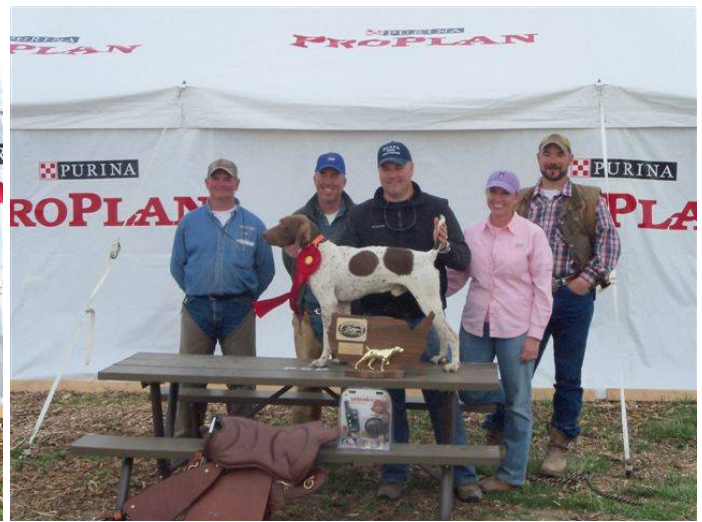
GPDA NATIONALS "DUKE"