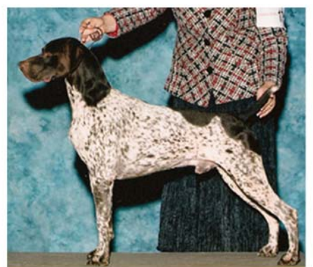
Sire "Cullen" Ch. Freiheit Spurhund Double Dare